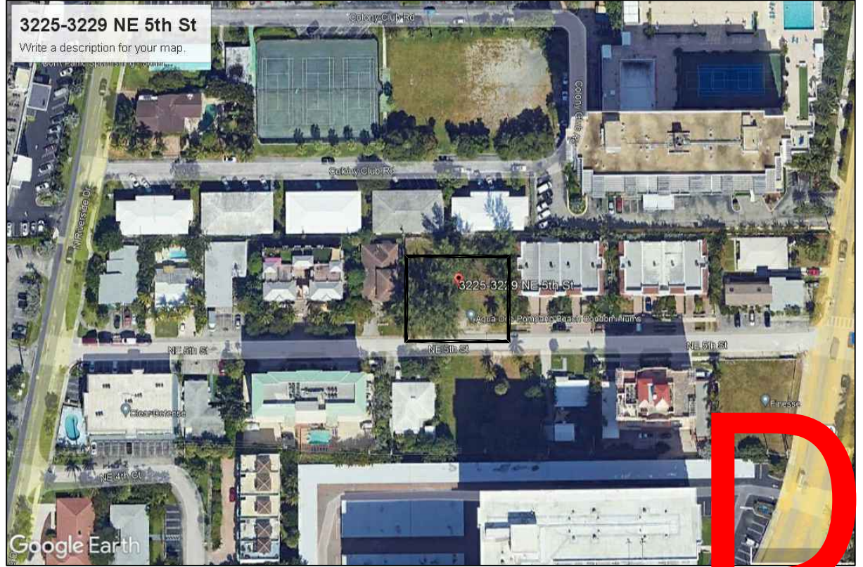
3 LOCATION MAP NTS

KEY PLAN Alioskar Ganem Osorio Digitally signed by Alioskar Ganem Osorio Date: 2024.12.02 11:40:36 -05'00'